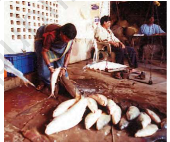
Top: Members of the TMS protesting at a rally. Above: A member of the cooperative weighing the fish.

With the TMS taking over the fishworkers were able to increase their earnings substantially. This was because they set up the cooperative which would buy the catch from them at a fair price. The cooperative would then arrange to transport and sell this in markets where they would get a good price. They have now begun to earn three times more than they earned earlier. The TMS has also begun giving the fishworkers loans for repair and the buying of new nets. By managing to earn a higher wage as well as preserving the fish in the reservoir, the TMS has shown that when people's organisations get their rights to livelihood, they can be good managers.