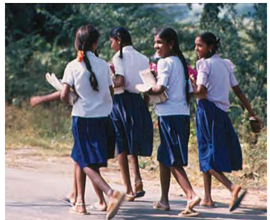
Why do girls like to go to school together in groups?

In what ways do the experiences of Samoan children and teenagers differ from your own experiences of growing up? Is there anything in this experience that you wish was part of your growing up?