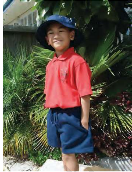
A Class VII Samoan child in his school uniform.

From Class VI onwards, boys and girls went to separate schools. The girls' school was designed very differently from the boys' school. They had a central courtyard where they played in total seclusion and