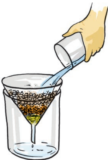
Fig. 18.2 Filtration process