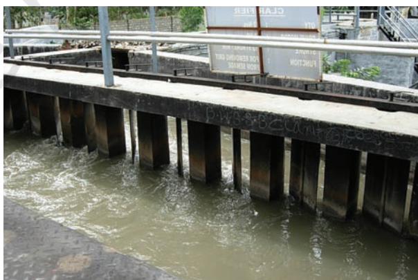
Fig. 18.4 Grit and sand removal tank