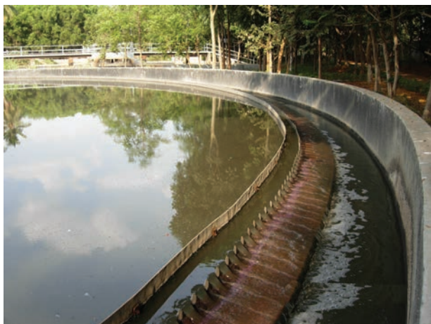
Fig. 18.5 Water clarifier

a scraper. This is the sludge . A skimmer removes the floatable solids like oil and grease. Water so cleared is called clarified water (Fig. 18.5).