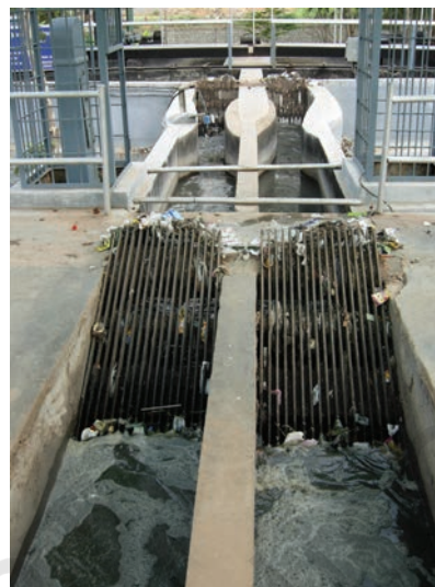
Fig. 18.3 Bar screen