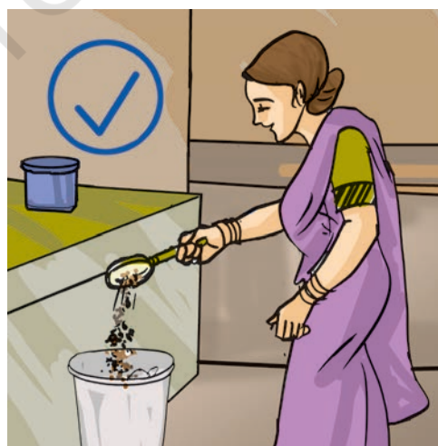
Fig. 18.7 Do not throw everything in the sink