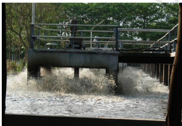
Fig. 18.6 Aerator

4. Air is pumped into the clarified water to help aerobic bacteria to grow. Bacteria consume human waste, food waste, soaps and other unwanted matter still remaining in clarified water (Fig. 18.6).