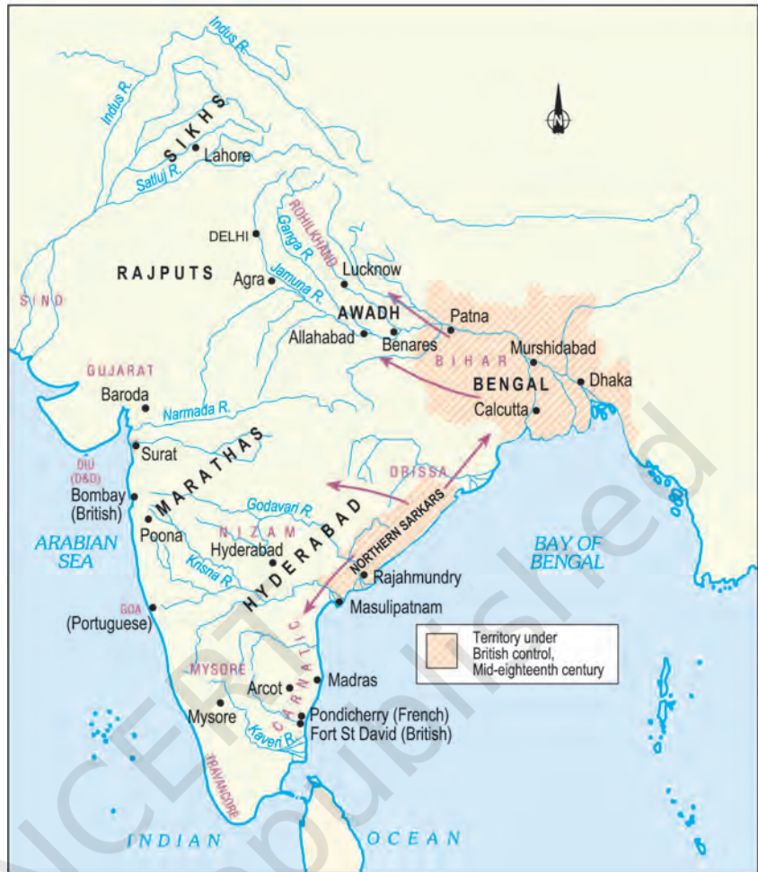
Map 2 British territories in the mid-eighteenth century.

In this chapter we will read about the emergence of new political groups in the subcontinent during the first half of the eighteenth century – roughly from 1707, when Aurangzeb died, till the third battle of Panipat in 1761.