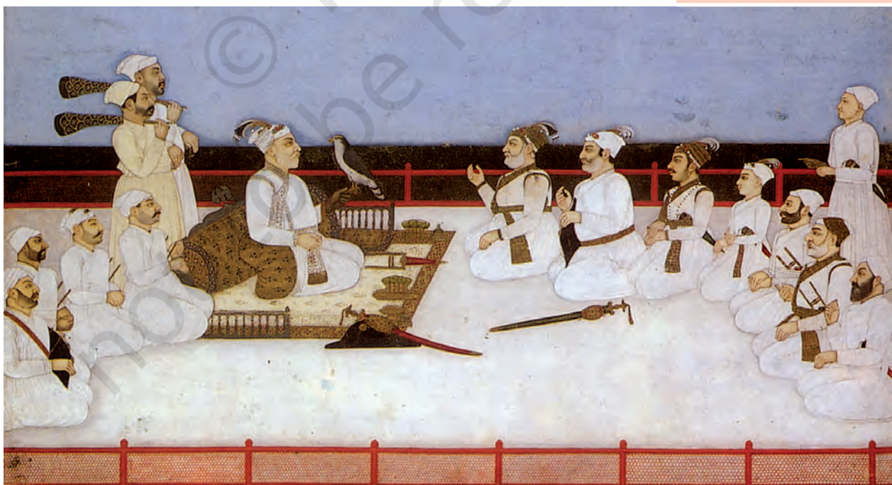
Fig. 4 Alivardi Khan holding court.

The formation of a regional state in eighteenth-century Bengal therefore led to considerable change amongst the zamindars. The close connection between the state and bankers – noticeable in