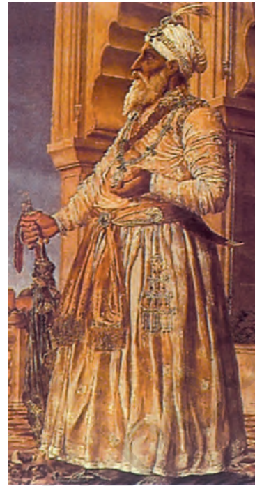
Fig. 3 Burhan-ul-Mulk Sa'adat Khan.

Burhan-ul-Mulk Sa'adat Khan was appointed subadar of Awadh in 1722 and founded a state which was one of the most important to emerge out of the break-up of the Mughal Empire. Awadh was a prosperous region, controlling the rich alluvial Ganga plain and the main trade route between north India and Bengal. Burhan-ul-Mulk also held the combined offices of subadari , diwani and faujdari . In other words, he was responsible for managing the political, financial and military affairs of the province of Awadh.