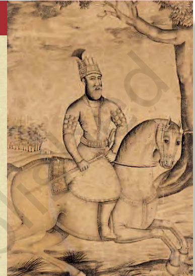
Fig. 1 A 1779 portrait of Nadir Shah.