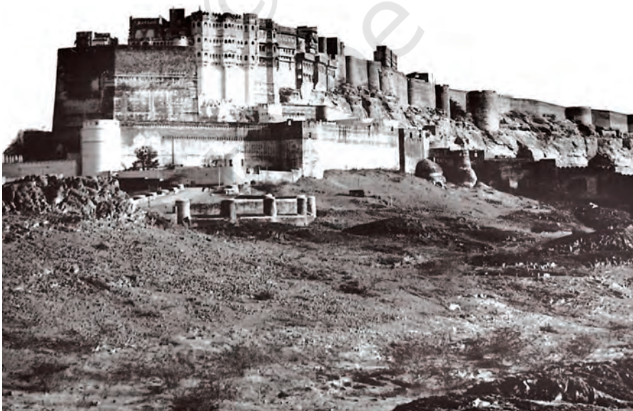
Fig. 5 Mehrangarh Fort, Jodhpur

Raja Jai Singh was at the height of his power. He was the governor of Agra for 12 years and of Malwa for 5 or 6 years. He possessed a large army, artillery and great wealth. His sway extended from Delhi to the banks of the Narmada.