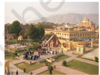
Fig. 4c Jantar Mantar in Jaipur

Sawai Jai Singh, the ruler of Amber constructed five astronomical observatories, one each in Delhi, Jaipur, Ujjain, Mathura and Varanasi. Commonly known as Jantar Mantar, these observatories had various instruments to study heavenly bodies.