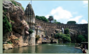
Fig. 4b. Chittorgarh Fort, Rajasthan

Many Rajput chieftains built a number of forts on hill tops which became centres of power. With extensive fortifications, these majestic structures housed urban centres, palaces, temples, trading centres, water harvesting structures and other buildings. The Chittorgarh fort contained many water bodies varying from talabs (ponds) to kundis (wells), baolis (stepwells), etc.