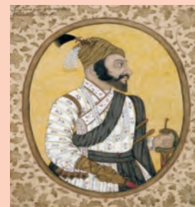
Fig. 7a Portrait of Shivaji

The Maratha kingdom was another powerful regional kingdom to arise out of a sustained opposition to Mughal rule. Shivaji (1627-1680) carved out a stable kingdom with the support of powerful warrior families ( deshmukhs ). Groups of highly mobile, peasant-pastoralists ( kunbis ) provided the backbone of the Maratha army. Shivaji used these forces to challenge the Mughals in the peninsula. After Shivaji’s death, effective power in the Maratha state was wielded by a family of Chitpavan Brahmanas who served Shivaji’s successors as Peshwa (or principal minister). Poona became the capital of the Maratha kingdom.