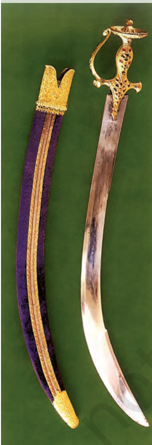
Fig. 7 Sword of Maharaja Ranjit Singh.

The organisation of the Sikhs into a political community during the seventeenth century (see Chapter 8) helped in regional state-building in the Punjab. Several battles were fought by Guru Gobind Singh against the Rajput and Mughal rulers, both before and after the institution of the Khalsa in 1699. After his death in 1708, the Khalsa rose in revolt against the Mughal authority under Banda Bahadur's leadership, declared their sovereign rule by striking coins in the name of Guru Nanak and Guru Gobind Singh, and established their own administration between the Sutlej and the Jamuna. Banda Bahadur was captured in 1715 and executed in 1716.