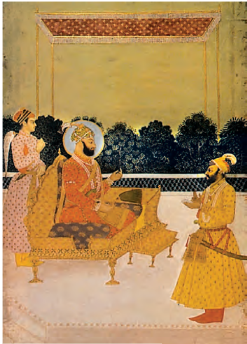
Fig. 2 Farrukh Siyar receiving a noble in court.

possible humiliation came when two Mughal emperors, Farrukh Siyar (1713-1719) and Alamgir II (1754-1759) were assassinated, and two others Ahmad Shah (1748-1754) and Shah Alam II (1759-1816) were blinded by their nobles.