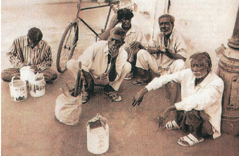
At labour chowk, daily wage workers wait with their tools for people to come and take them for work.

construction sites, lift loads or unload trucks in the market, dig pipelines and telephone cables and also build roads. There are thousands of such casual workers in the city.