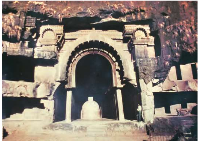
A cave at Karle, Maharashtra

Read page 100 once more. Can you think of how Buddhism spread to these lands?