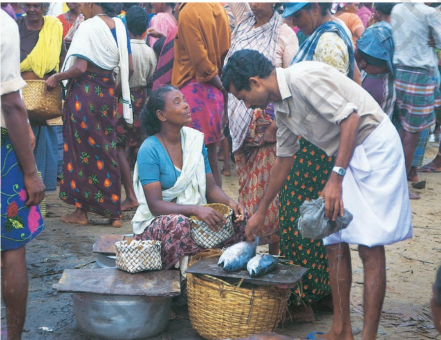
Fisher-woman selling the catch at the local market.