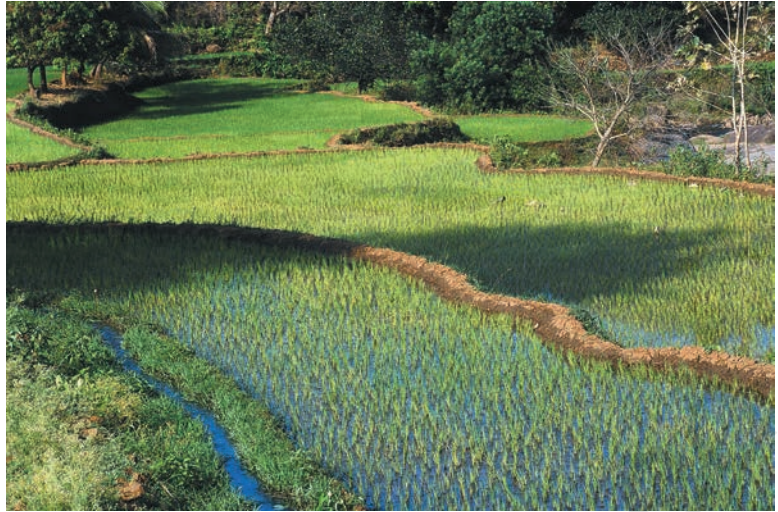
Transplanted paddy growing in a few of Ramalingam's 20 acres. A result of hard labour performed by agricultural workers like Thulasi.

This is when we can say they are caught in debt. In recent years this has become a major cause of distress among farmers. In some areas this has also resulted in many farmers committing suicide.