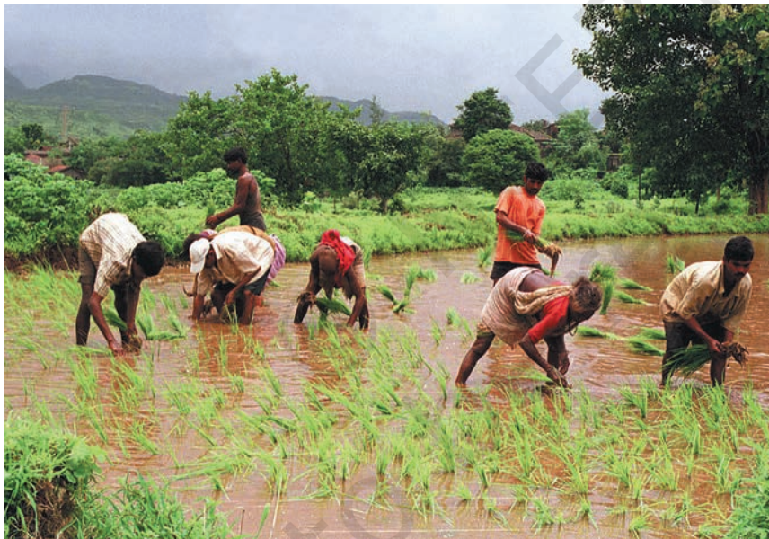
Transplanting paddy is back-breaking work.

The village is surrounded by low hills. Paddy is the main crop that is grown in irrigated lands. Most of the families earn a living through agriculture.