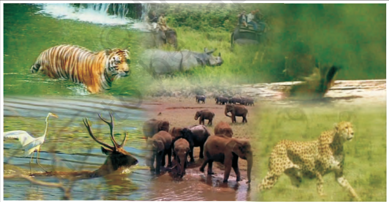
Figure 8.3 : Wildlife

In order to protect them many national parks, sanctuaries and biosphere reserves have been set up. The Government