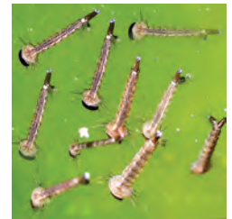
larvae seen through hand lens

Rajat: But flies don't bite. Then how do they spread diseases?