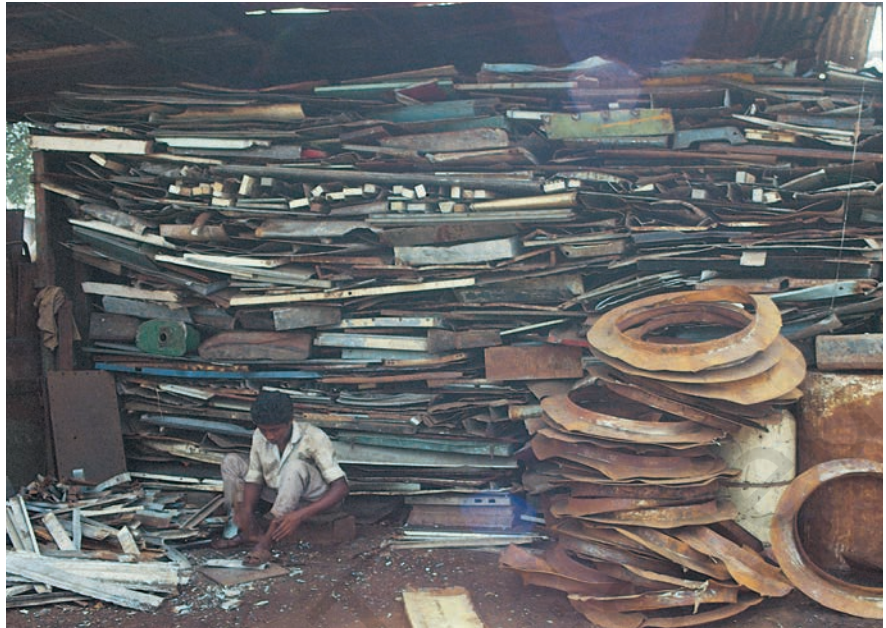
Recycling is not a new thing. People like the man in the photo above have been recycling paper, metal, glass and plastic for a long time. The kabadi wallah plays a major role in recycling household plastic and paper, including your note books.

Jehangir ate his kababs at top speed and as he wolfed them down he asked loudly from the kitchen, "Yasmin Khala where does the garbage that the Municipal Corporation collects go to?". The others were still eating when Yasmin Khala began to answer, "This question has an interesting answer. As you know you can usually find garbage