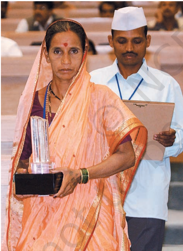
Two village Panchs from Maharashtra who were awarded the Nirmal Gram Puruskar in 2005 for the excellent work done by them in the Panchayat.

In some states, Gram Sabhas form committees like construction and development committees. These committees include some members of the Gram Sabha and some from the Gram Panchayat who work together to carry out specific tasks.