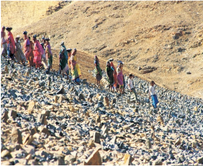
Watershed management has transformed this barren slope to a green meadow in just two years.