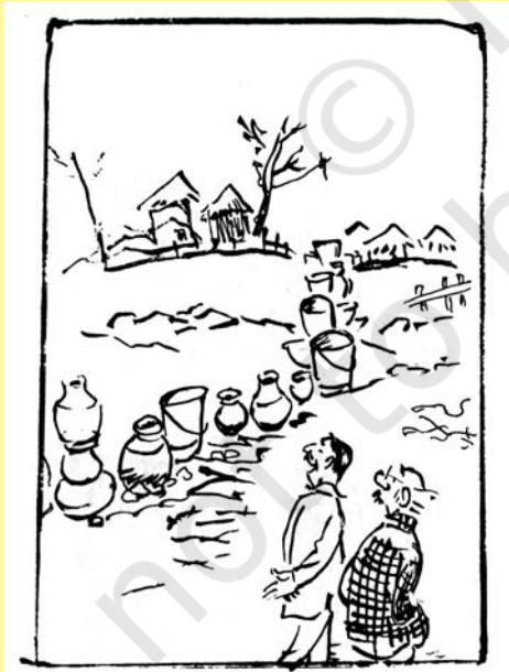
Not bad! One of the taps in the nearby village must be getting water!

What approval or disapproval is being expressed here?