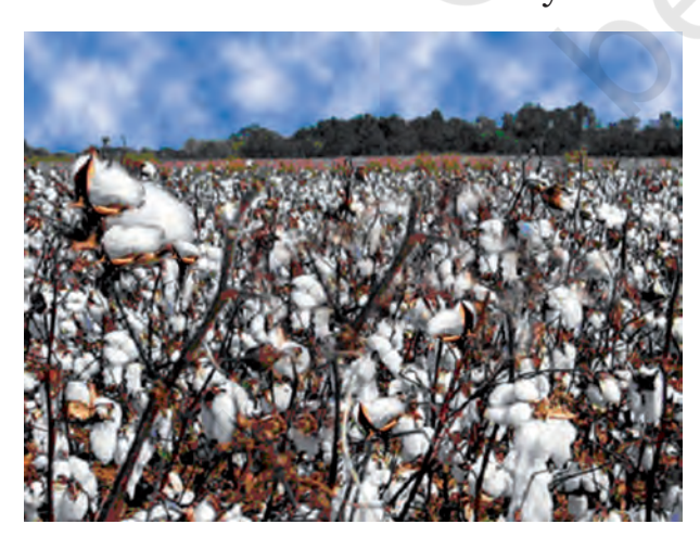
Fig.3.6 Field of cotton plants

Where does this cotton wool come from? It is grown in the fields. Cotton plants are usually grown at places having black soil and warm climate. Can you name some states of our country where cotton is grown? The fruits of the cotton plant ( cotton bolls ) are about the size of a lemon. After maturing, the bolls burst open and the seeds covered with cotton fibres can be seen. Have you ever