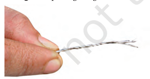
Fig. 3.5 Yarn split up into thin strands

You might have observed something similar when you try to thread a needle. Many a time, the end of the thread is separated into a few thin strands. This makes it difficult to pass the thread through the eye of the needle. The thin strands of thread that we see, are made up of still thinner strands called fibres.