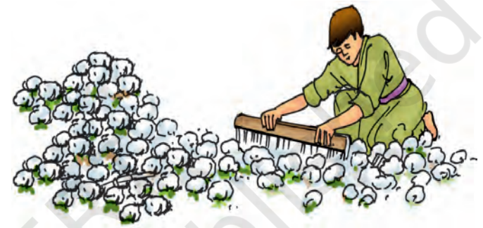
Fig. 3.7 Ginning of cotton

From these bolls, cotton is usually picked by hand. Fibres are then separated from the seeds by combing. This process is called ginning of cotton. Ginning was traditionally done by hand (Fig. 3.7). These days, machines are also used for ginning.