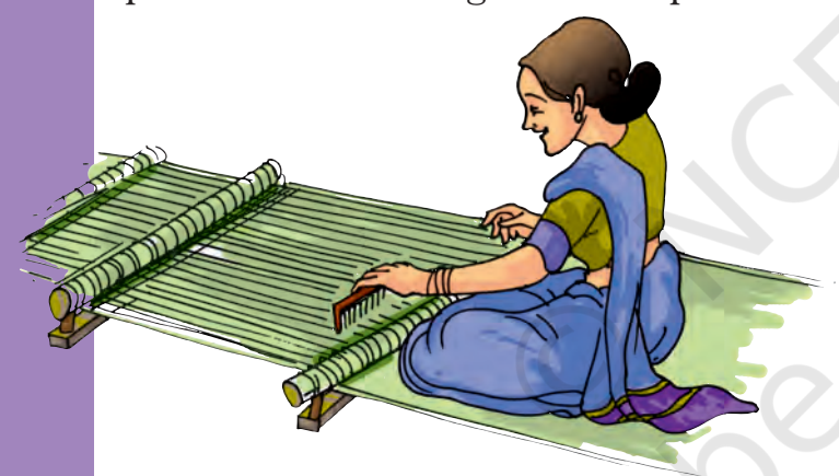
Fig. 3.13 Handloom

Fig 3.12 (a) and on the other as shown in Fig.3.12 (b). Cut both the sheets along the dotted lines and then unfold. Weave the strips one by one through the cuts in the sheet of paper as shown in Fig.3.12 (c). Fig. 3.12 (d) shows the pattern after weaving all the strips.