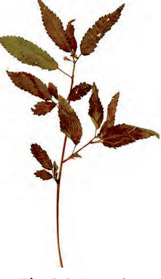
Fig. 3.8 A jute plant

mainly grown in West Bengal, Bihar and Assam. The jute plant is normally harvested when it is at flowering stage. The stems of the harvested plants are immersed in water for a few days. The stems rot and fibres are separated by hand.