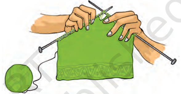
Fig 3.14 Knitting

Have you noticed how sweaters are knitted? In knitting , a single yarn is