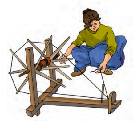
Fig. 3.11 Charkha

A simple device used for spinning is a hand spindle, also called takli (Fig. 3.10). Another hand operated device used for charkha is spinning (Fig. 3.11). Use of charkha was popularised by Mahatma Gandhi as part of the Independence movement. He Fig. 3.10 encouraged people to wear