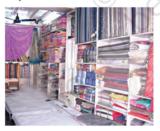
Fig. 3.1 A cloth shop

After their visit to the cloth shop, Paheli and Boojho began to notice various fabrics in their surroundings. They found that bed sheets, blankets,