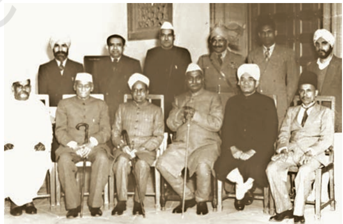
Some of the members who wrote the Constitution of India.

Therefore, India became a secular country where people of different religions and faiths