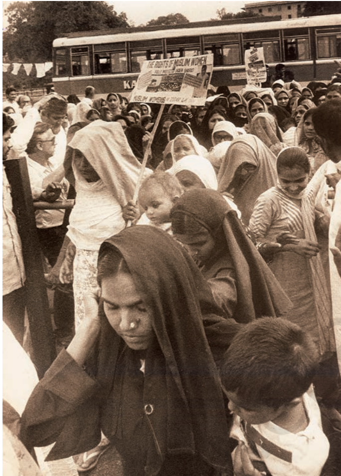
Women at a rally demanding their rights

discrimination had been practised in our society and how people had struggled against this. Many leaders of these struggles such as Dr Ambedkar had also fought for the rights of the Dalits.