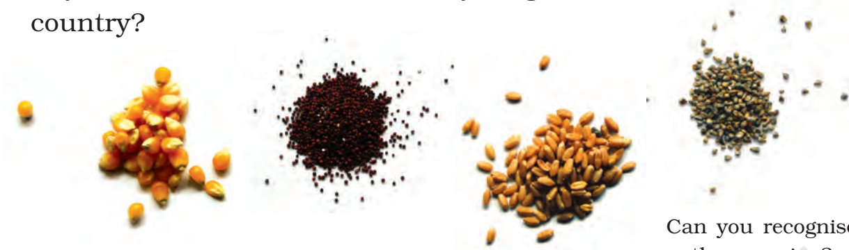
Can you recognise these grains?