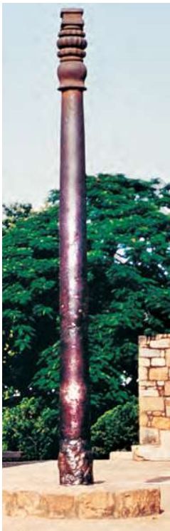
The iron pillar

on the pillar mentioning a ruler named Chandra, who probably belonged to the Gupta dynasty (Chapter 10). What is amazing is the fact that the pillar has not rusted in all these years.