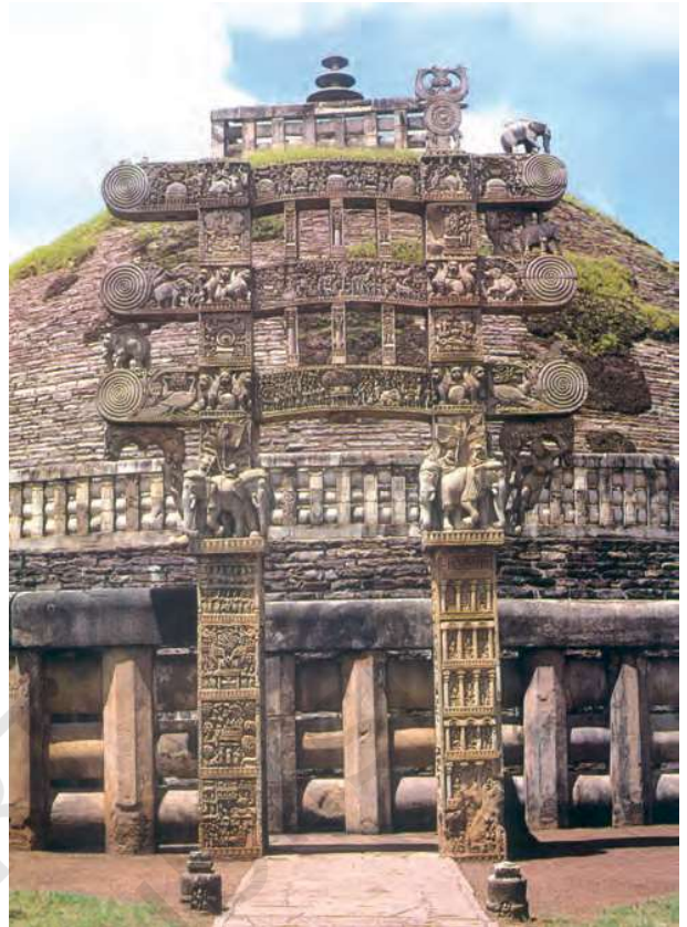
Top : The Great Stupa at Sanchi, Madhya Pradesh.

Some of the earliest Hindu temples were also built at this time. Deities such as Vishnu, Shiva, and Durga were worshipped in these shrines. The most important part of the temple was the room known as the garbhagriha , where the image of the chief deity was placed. It was here that priests performed religious rituals, and devotees offered worship to the deity.