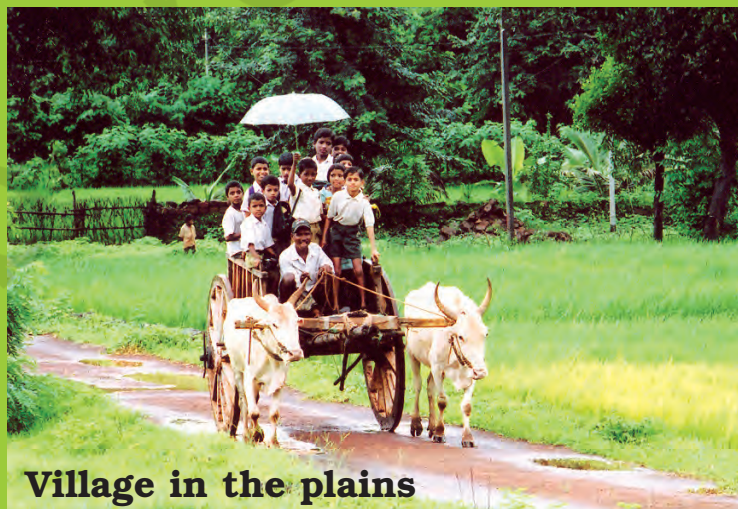
Village in the plains

We ride in our bullock-cart, going slowly through the green fields. If it is too sunny or raining, we use our umbrellas.